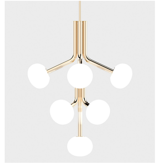
Handmade in Los Angeles