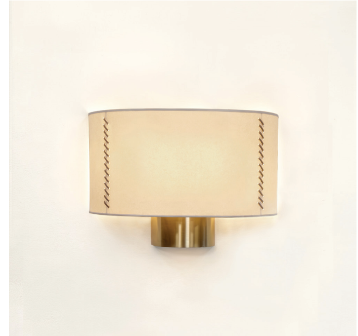
Handmade in Los Angeles

Finishes Satin Brass Polished Brass Silver Patina Shade Parchment with Leather Lace